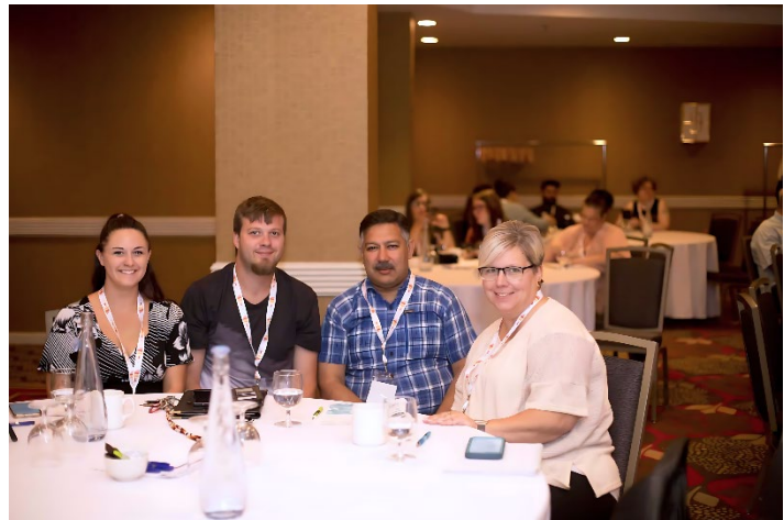
Staff of Crocus Co-op at the Mental Health for All Conference

The conference highlighted best practices, emerging research, and innovative approaches to mental health care delivery. It also provided a connection to organizations after years of fragmented service delivery throughout the pandemic.