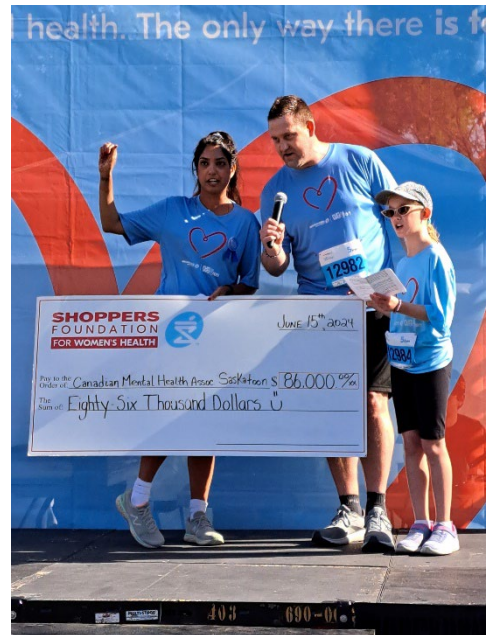
Run for Women 2024 Cheque Presentation

As we look ahead, we remain committed to our mission of mental health for all and building a community where everyone has the opportunity to thrive.